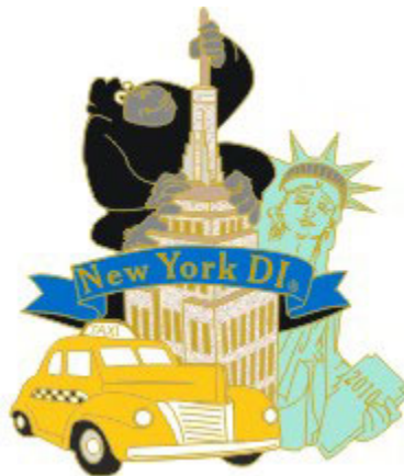
Single NY City Icons Pin